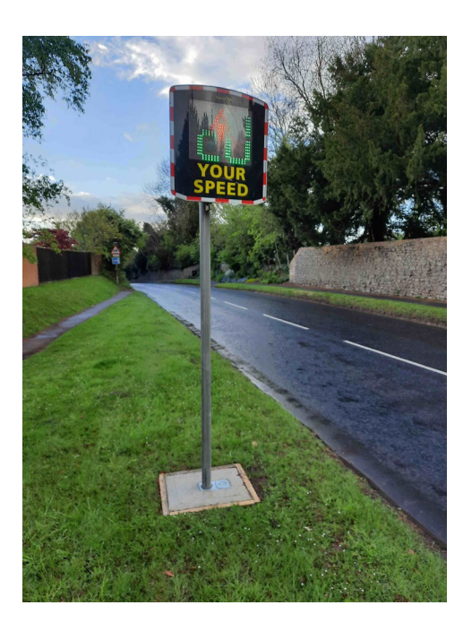
Image showing SID currently installed (May 2021) on the incoming Southend on the approach to John Masefield School

The site on the Hereford road was operation beginning in March 2021, but it has taken several months of follow-ups, cajoling and reminders to get the other sites prepared and completed even though LTC paid for these installations some time ago.